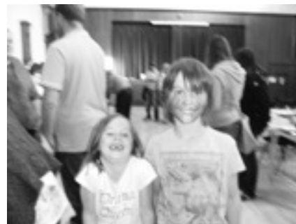
(c) what the mess is going to be afterwards.

We are delighted with the success of Messy Church and it is wonderful to see families returning time after time and attendees have grown from approximately 20 when we first started to a staggering 50/60! On arrival young and old are eager to find out