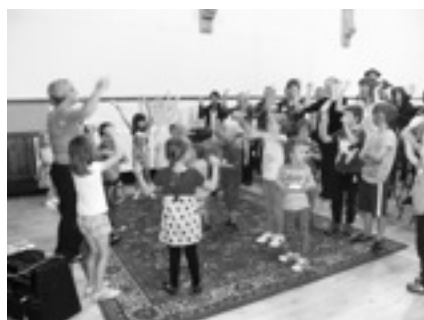
(b) what the story is going to be today