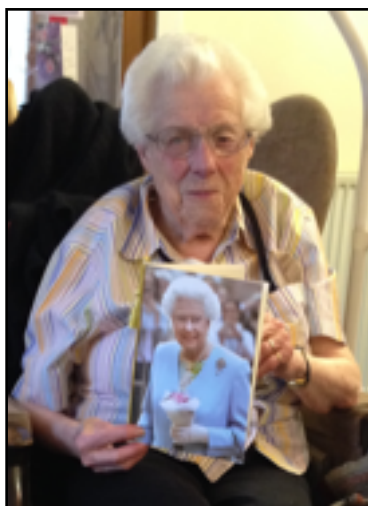
A special card to treasure.