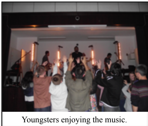
Youngsters enjoying the music.

On 1st November we were privileged to be a venue for the "Battle For Your Soul" tour. This is a tour with the Christian rock band SUPERHERO who hail from Glasgow and have toured Eastern Europe earlier this year. They were supported by the Californian band "Safe Haven" who feature in the newly released film "Gods not Dead". This was Safe Haven's first trip to Scotland and they had stopped off at Stirling Castle before arriving in Montrose where they took a huge amount of photos and couldn't believe they were playing in a town with so much history.