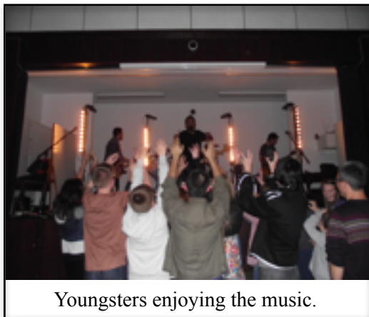
Youngsters enjoying the music.

On 1st November we were privileged to be a venue for the "Battle For Your Soul" tour. This is a tour with the Christian rock band SUPERHERO who hail from Glasgow and have toured Eastern Europe earlier this year. They were supported by the Californian band "Safe Haven" who feature in the newly released film "Gods not Dead". This was Safe Haven's first trip to Scotland and they had stopped off at Stirling Castle before arriving in Montrose where they took a huge amount of photos and couldn't believe they were playing in a town with so much history.