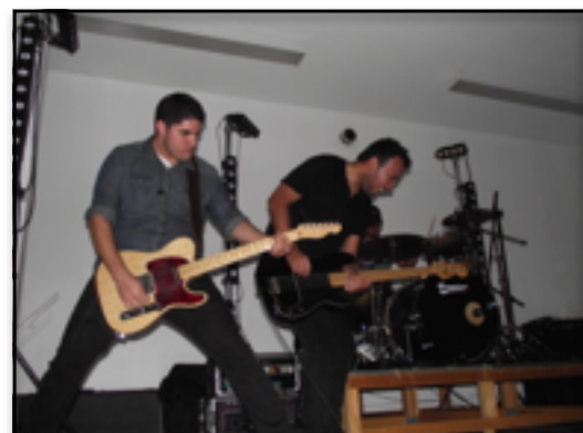
Enthusiastic delivery of their message.

The bands played an amazing concert which involved many members of the audience taking part and the atmosphere was great.