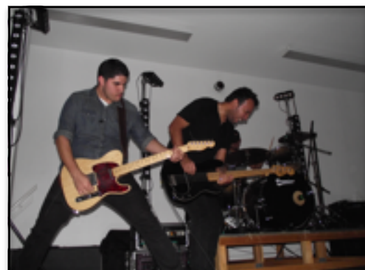
Enthusiastic delivery of their message.

The bands played an amazing concert which involved many members of the audience taking part and the atmosphere was great.