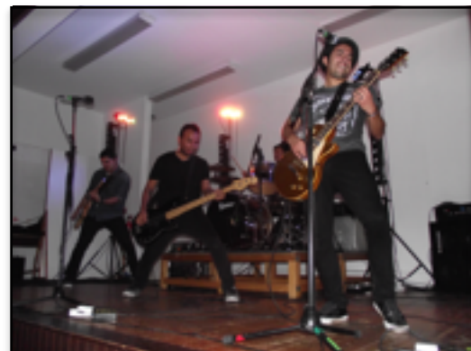
Superhero play to a delighted audience.

The concert began at 7.30 with a number of people of varying ages in the audience.