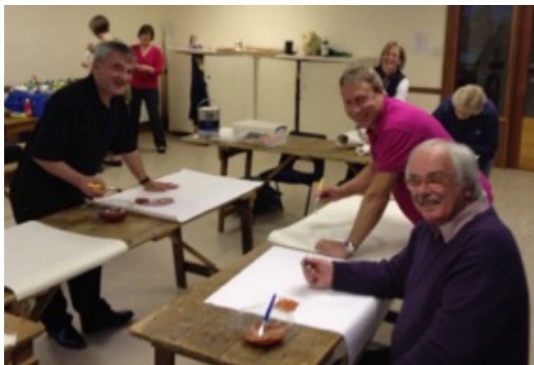
Summer Mission Painting team hard at work in the Tom Long Gallery