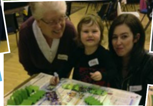
Messy Church activities