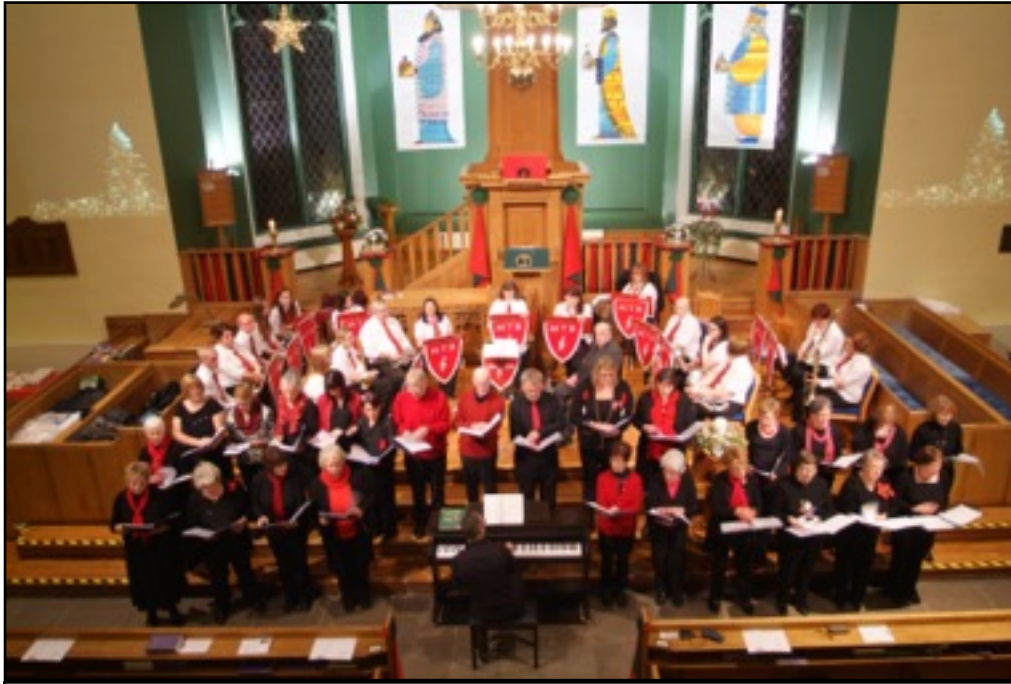
Carols in the Kirk with Montrose Town Band, Song Shop and the Church Choir. A wonderfully uplifting evening and enjoyed by everyone.

www.oldandstandrews.com Facebook – Montrose Old and St. Andrew's Twitter @SteepleNews Montrose Old an St. Andrew's