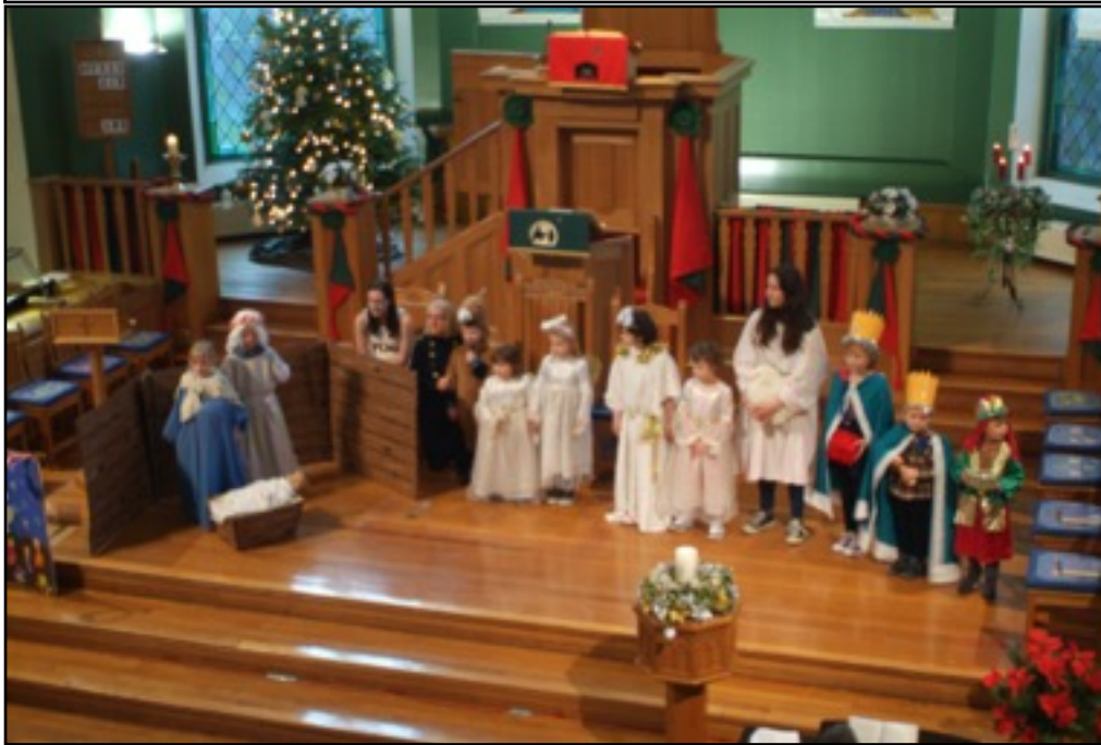
Youngsters from the Sunday School performed a delightful rendition of the Christmas Story. It was a lovely beginning to the Christmas Season.