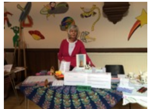
Pastoral Task Group

If you did not manage to attend this event, a follow up information leaflet will be distributed in November's Steeple News with contact details of all groups and activities that take place. There is a lot happening in the church but, there is always room for more people to become involved and therefore there will be a tear-off slip that you can complete if you are interested in finding out more about any particular group or activity. Please don't be shy – your Church needs you!