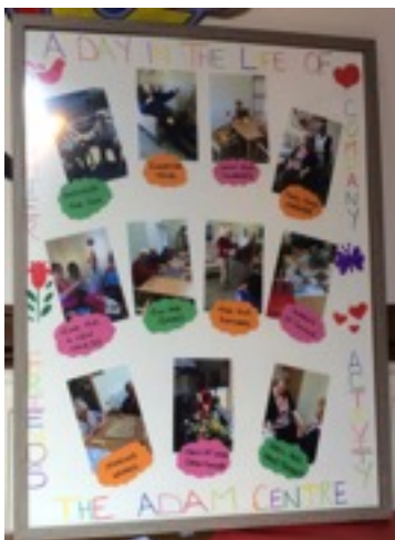
The Adam Centre