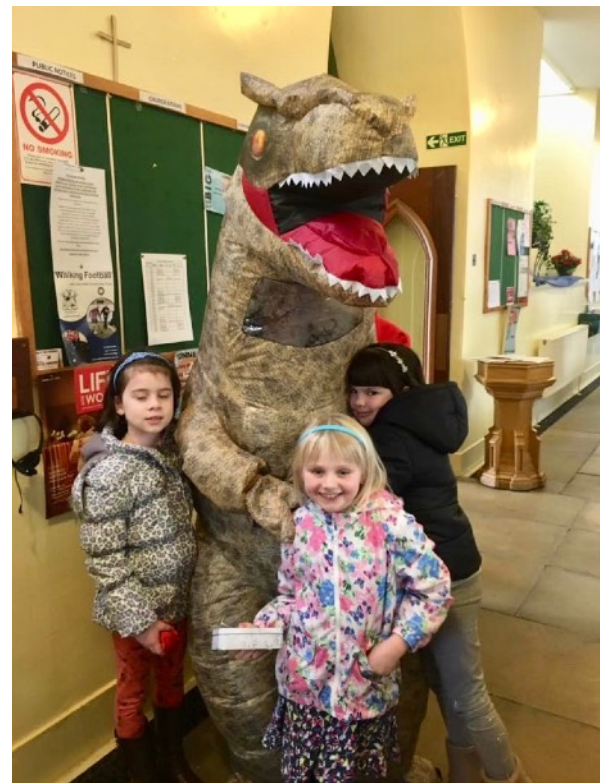
Some of our youngsters meet Dino

More information to follow and it is hoped the swim and monies raised will be completed before Easter.